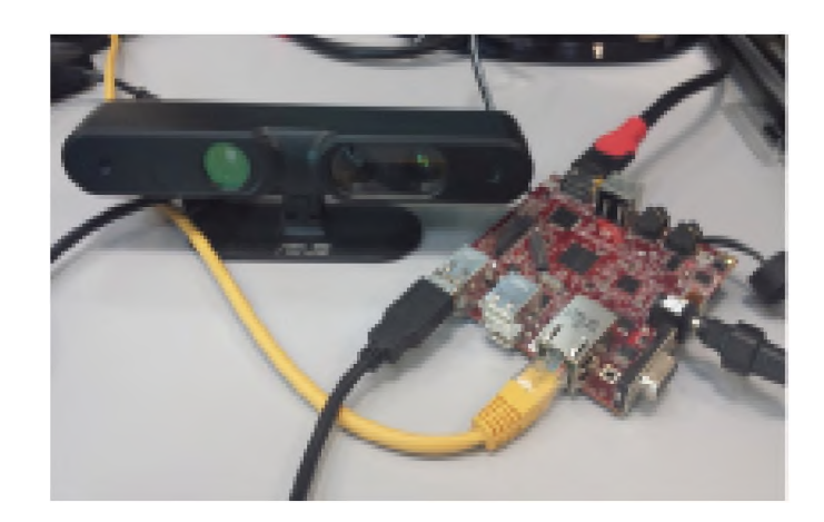
Figure 1: Asus Xtion Live depth camera and Beagleboard-xM platform.

The authors started its first system implementation using native compilation on the board instead of cross-compilation. The 3D camera was connected to the BeagleBoard-xM through an USB interface as shown in Fig 1. The output of the video was displayed on a desktop monitor connected to the BeagleBoard through a HDMI port. Interfacing with the robot platform will be done using serial connection established with the ROBOTIS CM700 servomotor controller, which will transmit/receive signals from/to the Beagleboard-xM.