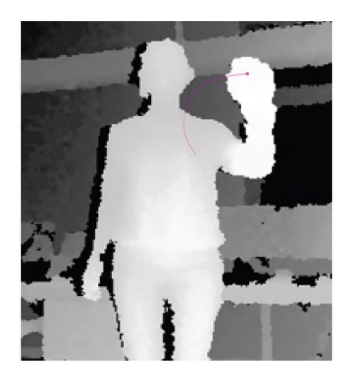
Figure 2: A depth image with human hand centroid tracking.

about 1 sec of video at 30FPS), there is enough information to calculate the velocity v of the current point p. The velocity v is calculated through the current node